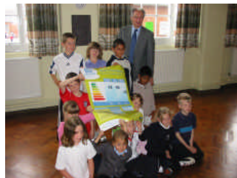
At Milton Keynes, Display is already in use at the Wyvern school

In addition to the accompanying measures which are promoted by the Display Campaign, Energie-Cités will propose to municipalities that they take part in a communication and promotion contest . The idea is to promote the communication and promotion initiatives that municipalities have set up to raise the level of interest amongst their citizens. This is based on the assumption that the vast majority of them are living in a building whose energy efficiency can certainly be improved.