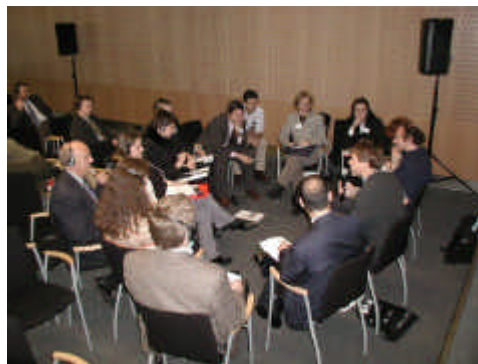
Brainstorming session at a Conference of Energie-Cités

(the unabridged version of the opinion is available from www.energie-cites.org )