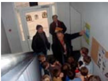
The mayor is explaining the poster to the children – Saarbrücken (DE)

Display is the result of networking activities between twenty municipalities from eighteen countries as represented by their energy managers . Collectively, they have created the product and all its various components, under the co-ordination of Energie-Cités: poster, calculation parameters, tests, promotion, etc. Of the municipalities involved, some were more experienced than others, some were from the North, whereas others were from the South, the East or the West of Europe.